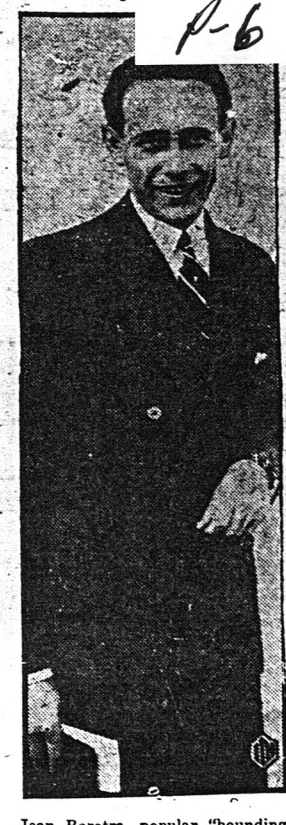
Jean Borotra, popular "bounding Basque" of the French Davis Cup aggregation, arriving in New York on the S. S. Ile de France for a business trip to the New World. But Jean admits that he may have to play a little tennis on the side—probably in the Nationals at Forest Hills, L. I.